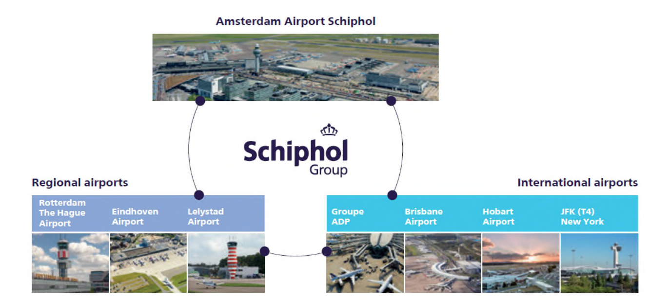
RSG's international activities.

RSG has made airport-related investments in Australia, France, Hong Kong, Italy and the United States.